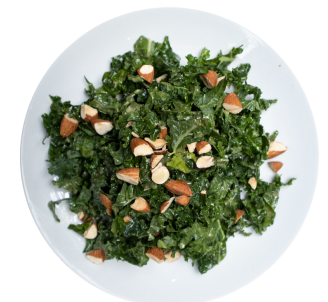
SIDE SALAD *choose asian slaw or kale salad 40K